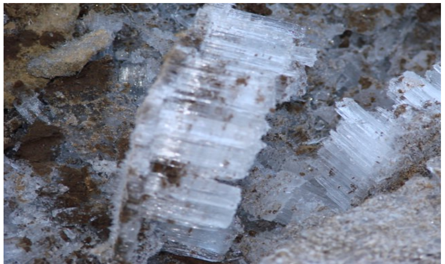
Above photo permafrost